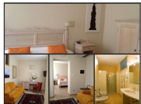
La Dama in Nero (The Lady in Black)